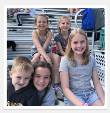
5th grade Amana Day